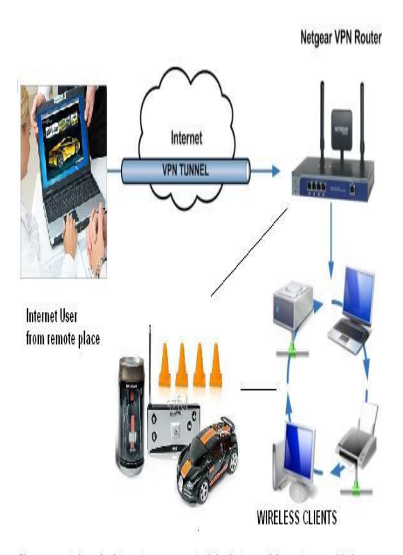
Fig represents how the Internet user can control the features of the motor car with the help of Wireless Mobile Router

By developing on web based application for the router to identifying the different part and to control its function in the browser. By providing the IP of the administrator, it shows the different part and the number of clients connected to it. The figure shows the router is connected with different clients using wireless technology with WIFI and how the dongle is connected to the router, so interconnection can be easily transmit to the different clients also, as the main connection of USB dongle with ISP joins to the router. As wifi connection is already in the router, it send signals to the electronic devices, now internet connection is also there & web application is developed, you can sends commands which is connecting with the internet. Electronic device is now directly connected with the wifi using mobile router, by developing web applications all the functions can be controlled and operated which one connected as clients with this WIFI mobile router. From the remote applications we can connect to the router mobile and then can connect all the clients & do operations. Here electronic devices can also be connected with the WIFI router, as they get more signal strength. So a person from remote place also connected with the electronic devices and do operations on it.